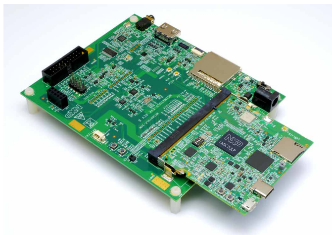
Figure 4: NXP's i.MX 7ULP EVK

To aid development of such devices, NXP offers the i.MX 7ULP Evaluation Kit (EVK) shown in Figure 3. A system-on-module (SOM) board, the EVK has 1GB of LPDDR3 memory, 8MB of quad-SPI flash, a Micro SD socket, Wi-Fi/Bluetooth capability, USB connectors, and an NXP PF1550 power management IC. The SOM plugs into a baseboard with a full SD/MMC card socket, audio codec, sensors, an HDMI connector, and an MIPI display connector. It supports Linux®, Android™, and FreeRTOS. More information is available at https://www.nxp.com/IMX7ULPEVK .