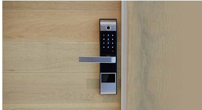
Figure 3: Smart Lock

Smart locks differ. They can house four alkaline AA batteries instead of coin cells or custom lithium-ion power packs. Unlike a wearable that's charged daily, a homeowner changes these batteries only annually. The lock also might have no screen but have a camera to record who comes to the door. This image unlocks the door if artificial intelligence (AI) algorithms running on the smart lock recognize the person. Easing the development task, the application domain of the i.MX7 ULP processor includes camera interfaces, and the Cortex-A7 CPU with Neon extensions is powerful enough to run AI algorithms suitable for this kind of home automation.